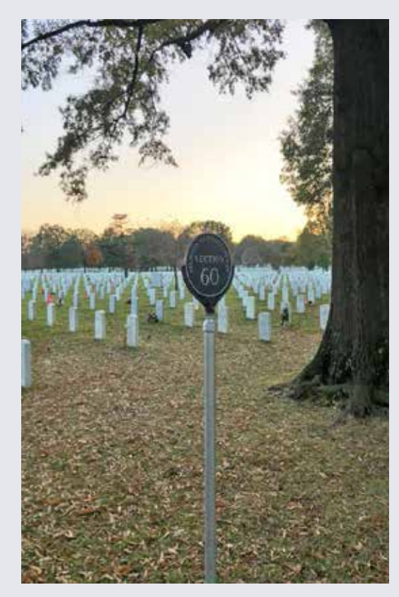
Section 60 at Arlington National Cemetery - Monuments and Memorials Tour in Washington, DC