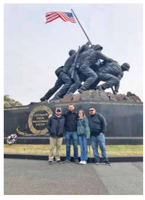
Monuments and Memorials Tour in Washington, DC

he award-winning first class in the Combat Veterans Certificate , Embracing the Stories of War , has reached an important five-year milestone.