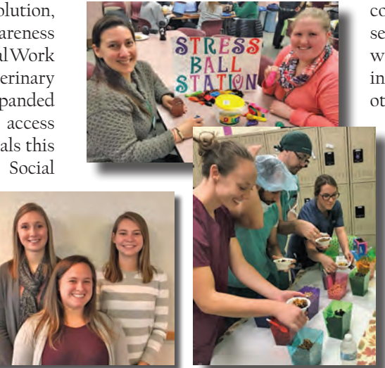
"I think you guys are doing a tremendous job ! I really like these sessions!"

An additional goal for this year has been normalizing the need for regular self-care and wellness within the high-