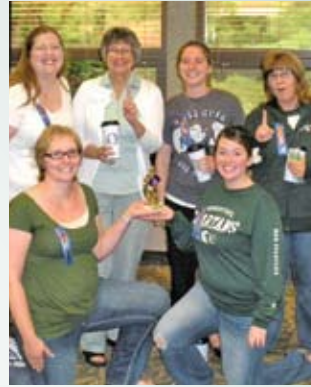
Congratulations to the winners of the 2011 Cosmic Disco Blended Bowl-A-Rama!