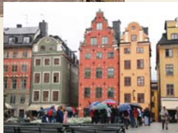
The Finland experience included a day trip to Stockholm, Sweden!