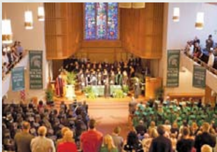
2011 Graduation Ceremonies were held at the Peoples Church on May 6.

M ichigan State University aims to advance knowledge and transform lives. The MSU School of Social Work plays a key role in bringing to life the mission and purposes of Michigan State University.