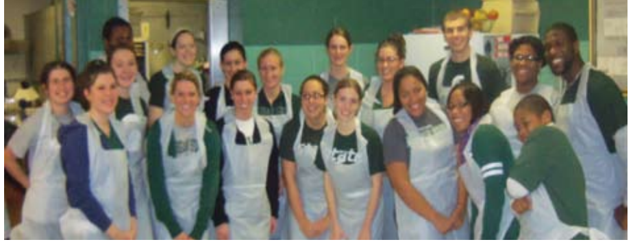
Students for Multi-Cultural Action (SMCA) at Volunteers of America

The Diversity Themed Events Committee organized a November trip to the Saginaw Chippewa Reservation in Mt. Pleasant, MI, to visit the tribal museum and service organizations.