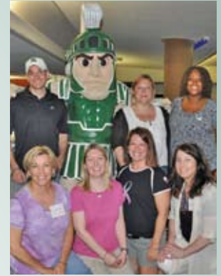
The Grand Rapids Great Eights had a great time meeting Sparty at Summer Institute.