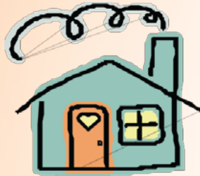
This was an immensely popular and successful project.