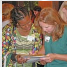
At Fall Orientation, incoming Flint and East Lansing MSW students work together on a scavenger hunt to help them learn about social work at MSU.