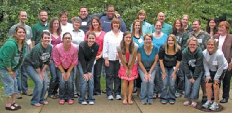
The Statewide Blended Program welcomed its sixth cohort to Summer Institute in June 2011.