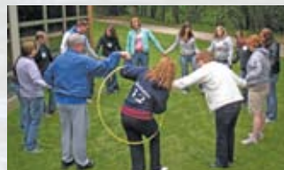
Team building activities help build cohesive learning communities across the state. See story on page 5.