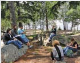
Students go global, gain from experiences in Finland, Mexico, and Ghana. See pages 6-7.